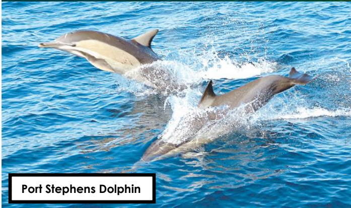
Port Stephens Dolphin